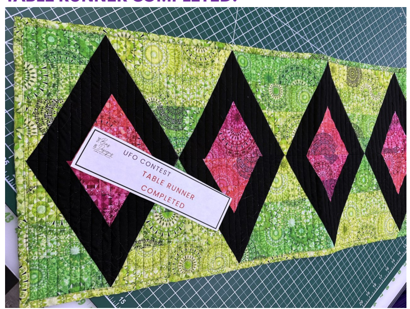
TABLE RUNNER COMPLETED: